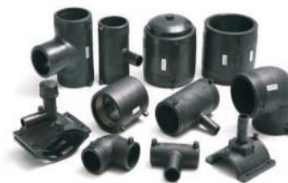
HDPE Electro Fusion Fitting