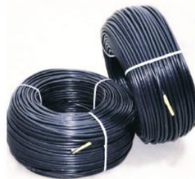
HDPE Coil Pipe